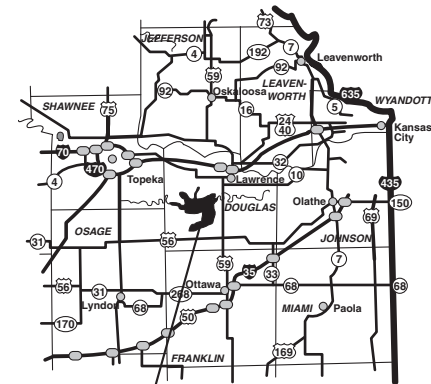
Clinton Reservoir, State Park & Wildlife Area General Area Map

CG#3 - 260 camping pads total; 91 with 30 amp electricity and water, 31 with 50 amp electricity and water. $2.50 extra prime site charge.